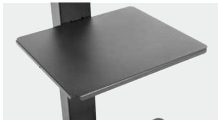
AV Component Shelf space for media boxes, remotes and other small items.