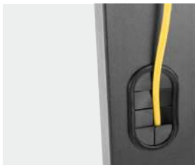
Cable Management maintains a clean look.