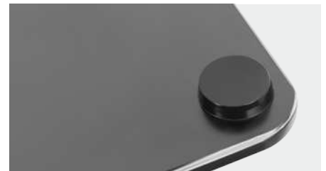
Anti-Slip Pads for stability while protecting flooring.